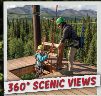
360° SCENIC VIEWS