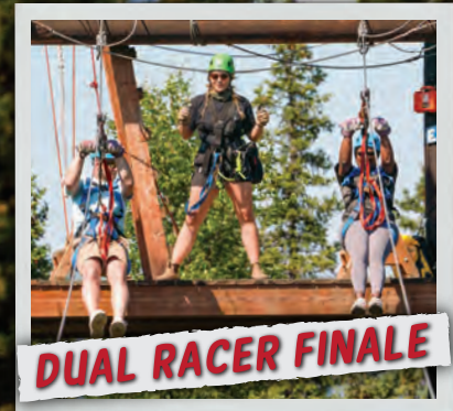
DUAL RACER FINALE