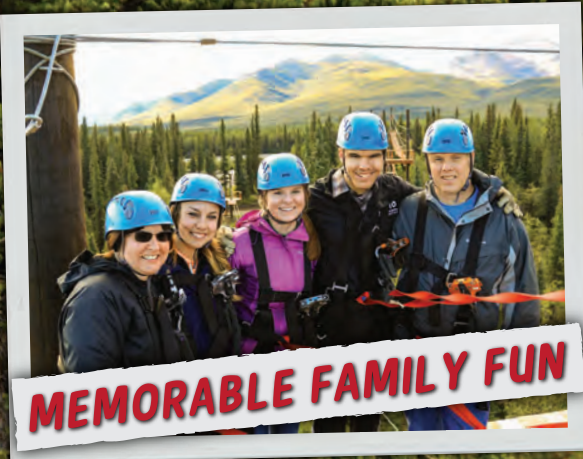
MEMORABLE FAMILY FUN

- TOUR PRICES - Adult (13 & older) $179 Child (ages 8-12) $119 All guests must be at least 8 years of age and weigh between 70 - 280 lbs.