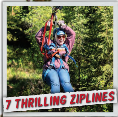
7 THRILLING ZIPLINES