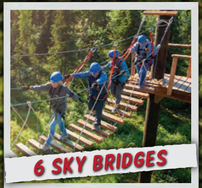
6 SKY BRIDGES